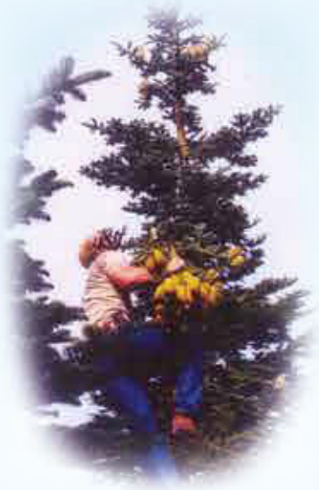
Collecting Fir Cones for Drying