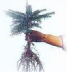
3 Year Old Tree