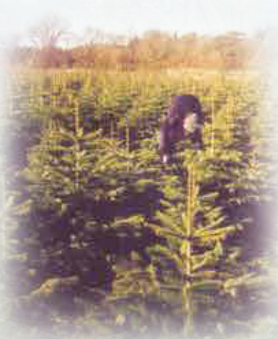
Bottom Pruning to improve air circulation