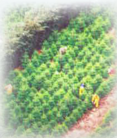
Pruning and Weed control