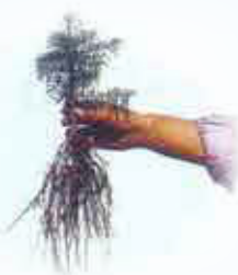
2 Year Old Tree