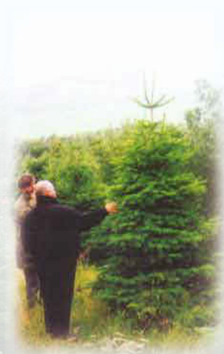
Selection before Tagging