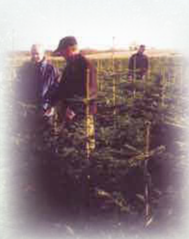
Inspection of trees throughout the year