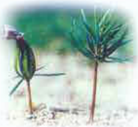
4 Month Old Seedling